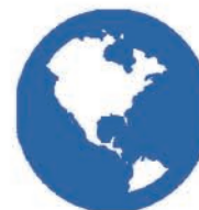
Estd. 1983 Global Expertise