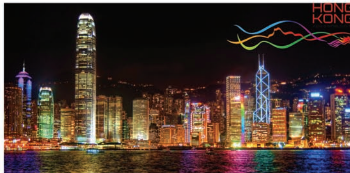
Victoria Peak, Madame Tussauds, Sky100, Ocean Park, Disneyland, Macau Tower