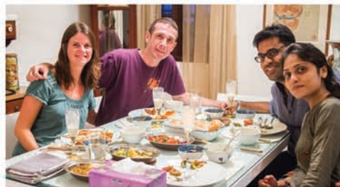
Dine with Indian Family