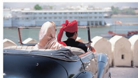
Vintage Car Ride