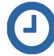
Quick Response Time