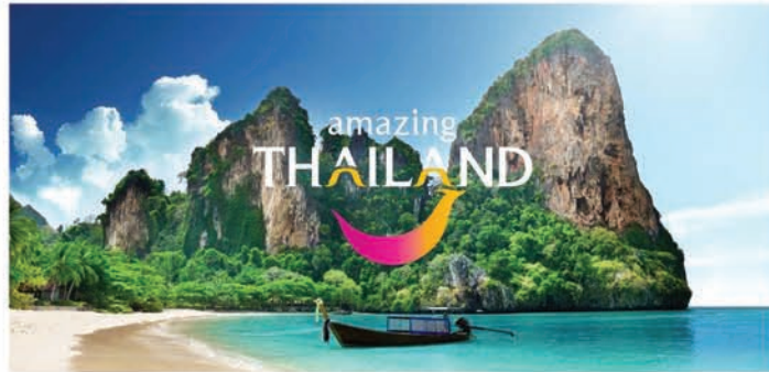
Bangkok, Hua Hin, Samui, Pattaya, Krabi

If you too have the dream of visiting the world, we are here to help you out!