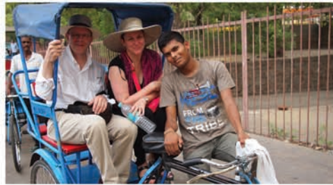
Rickshaw Puller Ride