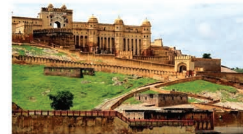
Forts & Palaces