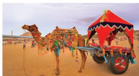
Camel Cart Ride