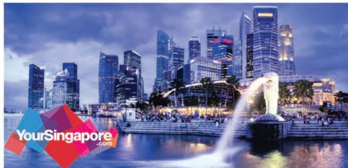
Singapore Flyer, Zoo, Night & River Safari, Sentosa, Universal Studios, S.E.A Aquarium, Jurong Bird Park, Gardens by the Bay