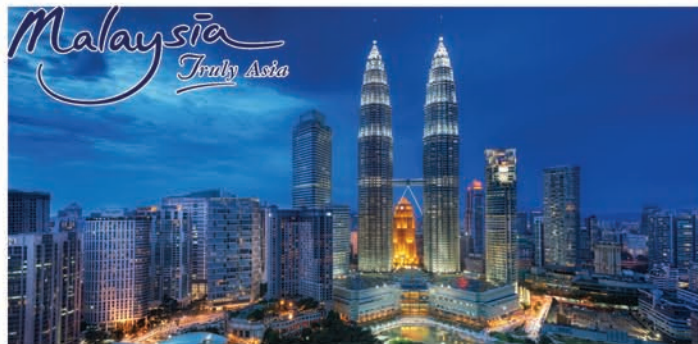
Kuala Lumpur, Genting Highlands, Ipoh, Penang, Malacca, Langkawi, Putrajaya