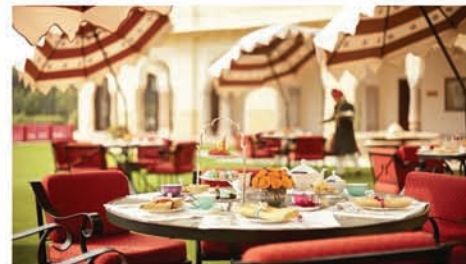
Dine with Living Maharajas