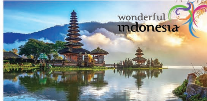
Bali, Denpasar, Ubud, Kintamani, Jakarta