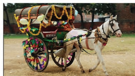
Horse Cart Ride