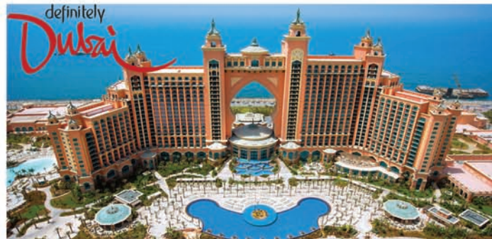
Dubai Museum, Burj Khalifa, Aquarium & Underwater Zoo, Desert Safari, Dhow Cruise, Miracle Garden, Global Village, Grand Mosque