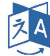
Govt. Approved Language Guides