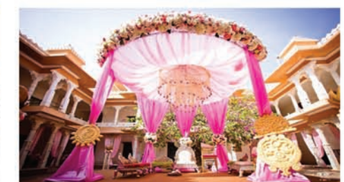
Wedding in India