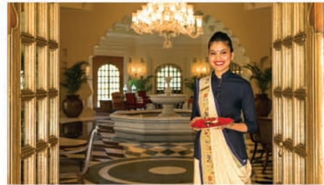
Traditional Indian Welcome

Experiences which leaves you speechless then turns you into a storyteller