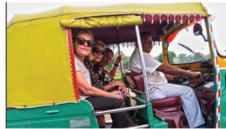
Auto Rickshaw Ride