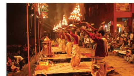
Religious & Spiritual