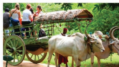
Bullock Cart Ride