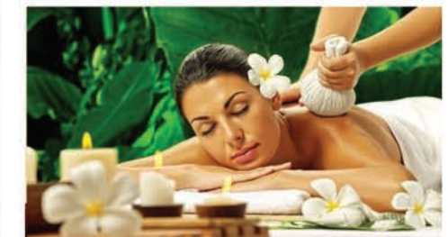
Spa & Wellness