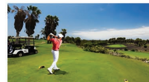
Golf in India