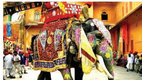
Caparisoned Elephant Ride